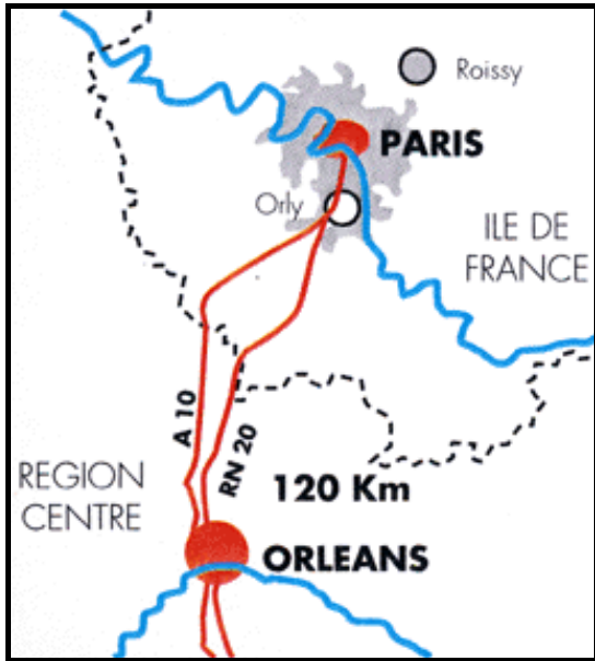
Simplified map between Paris and Orléans. Hotel Les portes de Sologne (Anchorage) and BRGM are located in the southern part of Orléans.

take the direction Orléans from Paris, then cross all the city of Orleans through Vierzon direction. In the southern part of Orleans, exit at "CHRO, Hospital d'Orléans-La Source" (see the local map below).