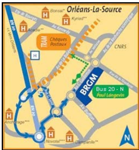
Hotel Anchorage called Les Portes de Sologne (on the left) and BRGM site. There is about 1,5 km between the hotel and BRGM