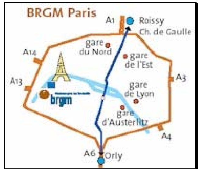
Schematic map of Paris