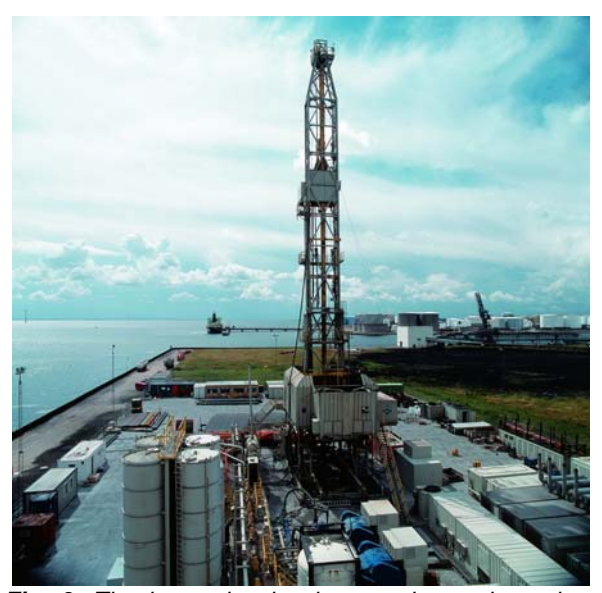
Fig. 3. The increasing involvement in geothermal related activities has so far resulted in two successful exploration wells near Copenhagen, Margretheholm -1 and -2.

hagen. Prior to the successful drilling, GEUS had carried out assessments of six possible geothermal drilling sites and prepared the geological foundation for the drilling, using DONG A/S as the operator.